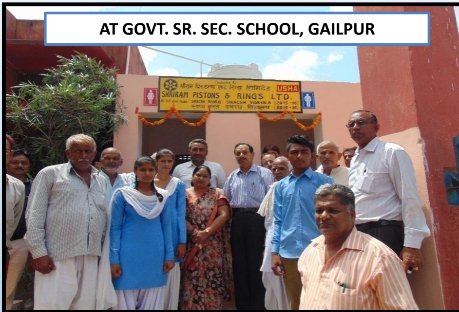
AT GOVT. SR. SEC. SCHOOL, GAILPUR