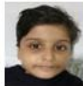
ALI-06241 MST. LTKARSH