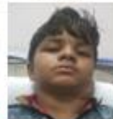
ALI-09300 MST. PINKU