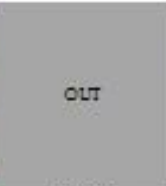
AR-11940 SHASWAT TAK