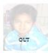
AR-11460 S MERAJUDDEEN